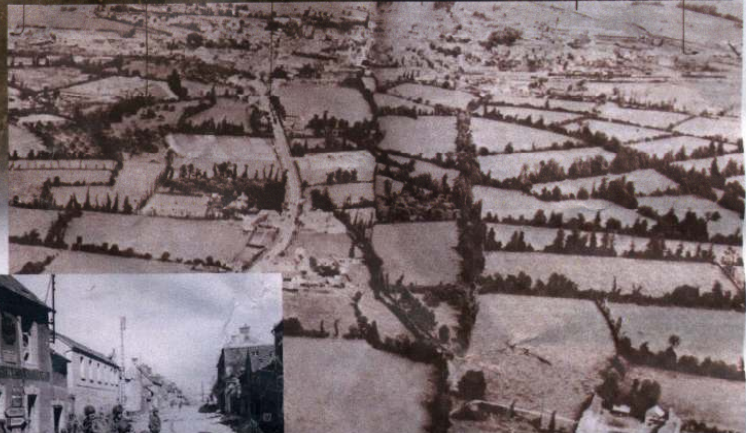
CARENTAN - 101st Airborne in June, 1944 and an aerial view from the southwest & surrounding countryside.