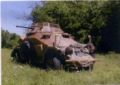
German Armored Car, Camp Anderson, TX

Join us on Saturday and Sunday of May 14-15, 2011 at Camp Anderson, TX as Allied and Axis forces face off in the Battle Beyond Carentan.